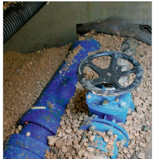
On the left: Manhole above the slope with expansion compensation and other construction details consisting of a straight pressure pipe with two welding beads, a flanged socket, a flanged valve for maintenance and a flanged spigot for the connection of ductile iron pipes with BLS®/VRS®-T push-in joints. On the right: Manhole with fittings and valve