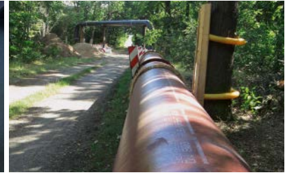
Course of the portable line along a forest road