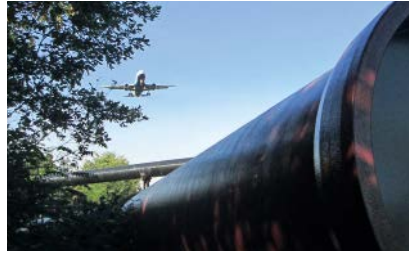
Portable line near Berlin Tegel Airport