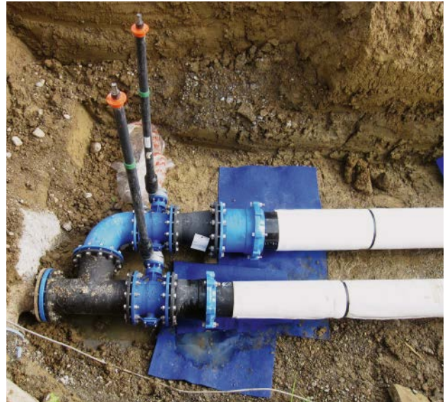
vonRoll ECOPUR ductile iron pipes, vonRoll ECOFIT fittings and vonRoll shut-off valves