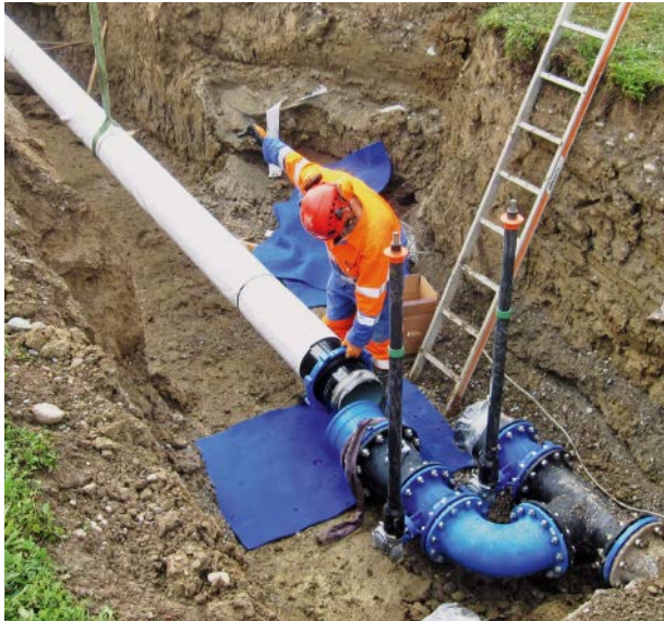
Assembly of a ductile iron pipe vonRoll ECOPUR