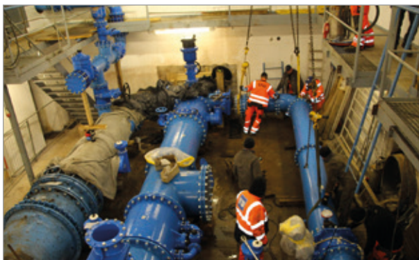
Installation of ERHARD butterfly valves mounted on the pipeline.