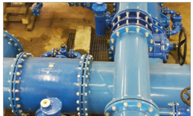
Final situation after the renovation measure.