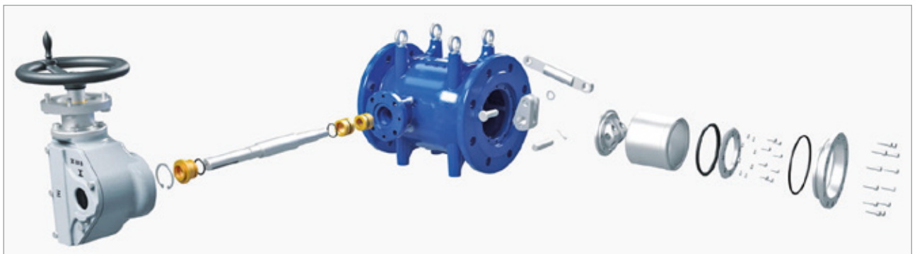
Components of the Düker RKV type 7015 plunger valve.

Dry technical texts alone do not do the trick here – but pictures! A picture speaks more than a thousand words, but a picture is also only a momentary snapshot. The interplay of components can only be illustrated if the components are moving. This provides an opportunity to present products such as the RKV Type 7015 Plunger Valve to customers at trade fairs and other events. It's quite simple: with moving pictures! Because a film can best demonstrate the many carefully thought-out details for example these of the Düker plunger valve.