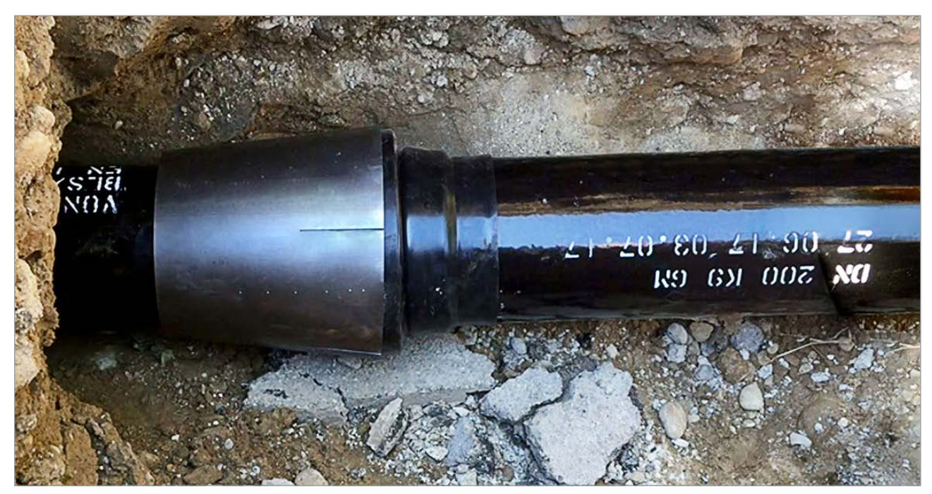
Pulling the ECOPUR ductile iron pipes into old grey cast iron pipeline after bursting