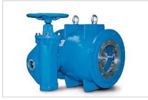
ERHARD plunger valve with slider-crank mechanism (SCM)