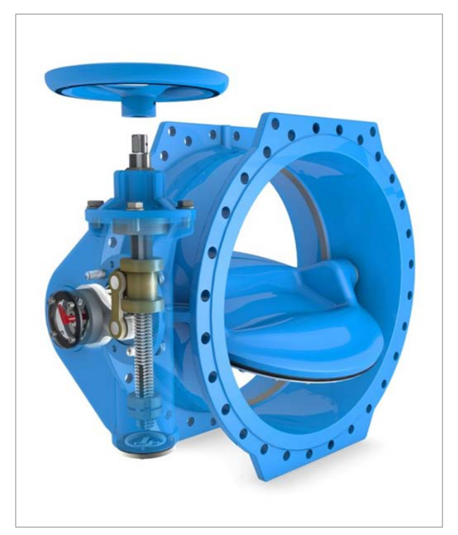
ROCO wave butterfly valve with slider-crank mechanism (SCM)