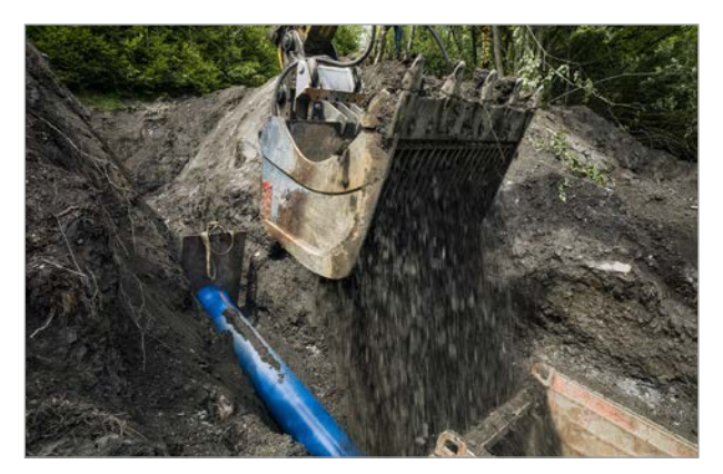
Backfilling the pipe trench with the soil previously excavated

The project sponsor, ÖBf Wasserkraft GesmbH, decided in favour of using ductile iron pipes from TRM – Tiroler Rohre GmbH for the penstock pipeline. 1,630 m of DN 500 pressure pipes were installed, equipped with VRS®-T positive locking push-in joints. This choice of product avoided the necessity of constructing thrust blocks all along the route, e.g. by encasing bends in concrete, thereby reducing overall building costs.