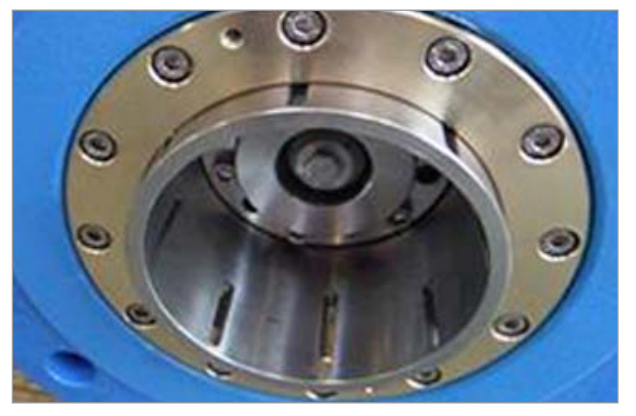
Close-up of the special slotted cylinder