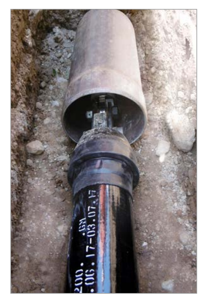
Connecting the traction head to the expansion cone

For years now, the Biberist water supply company has been using durable vonRoll ECOPUR ductile iron pipes with reinforced polyurethane coating to EN 545 for its drinking water supply network. And in this project too, the pipeline was replaced with tried and tested ECOPUR pipes. ECOPUR full-protection pipes have integral polyurethane (PUR) lining and coating in accordance with EN 15655 and EN 15189; with their mechanically high resistant, ultra-smooth PUR coating they are perfect for trenchless installation techniques. And the slim socket contour of ECOPUR pipes also has a positive effect on the resulting pulling-in forces. The positive locking, de-flectable vonRoll HYROTIGHT trenchless joint technology deals with the forces occurring, as well as deflections in the route of the pipeline of up to 5° without problem. During the entire project, completed in a number of daily stages, some 310 m of ductile vonRoll ECOPUR DN 200 cast iron pipes were laid using the static burst lining technique. The pulling-in and installation work was carried out according to requirements and directives of DVGW technical information sheet GW 323 and SVGW guideline W4.