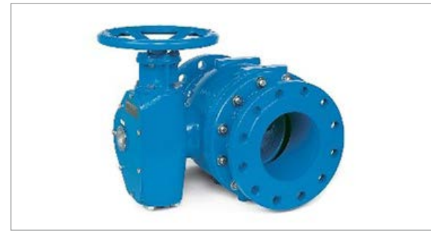
ERHARD ball valve with slider-crank mechanism, double eccentric shaft bearing