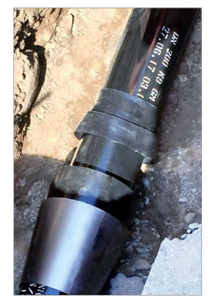
HYDROTIGHT trenchless push-in joint