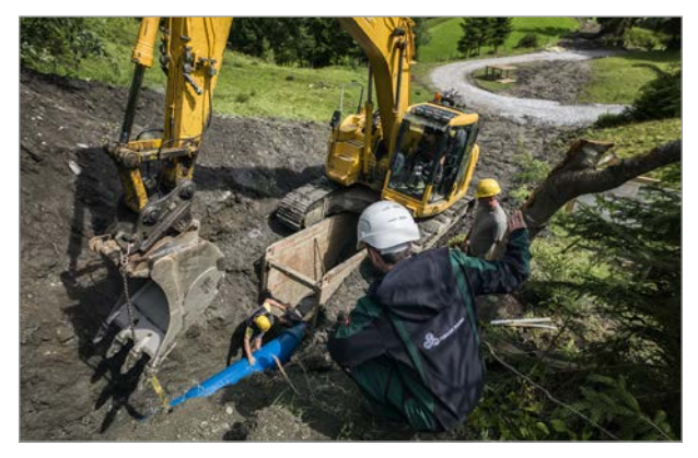
Assembling the pressure pipeline with VRS®-T restrained push-in joints in the pipe trench

In order to be able to supply around 1,000 households with clean electricity in future, the ÖBf decided to build a new small-scale hydropower plant in the district of Dorfgastein. This is a modern high-pressure power plant which, in future, will use energy from the water of the Luggauerbach. This new power plant has been constructed in accordance with the highest ecological standards, using environmentally friendly construction methods. For example, the minimum residual flow value of the stream has been determined according to the latest legal requirements. In order to keep the encroachment into the natural landscape of the Gastein valley as low as possible, the width of the route during construction was limited to 6 m. Once commissioned, the small hydropower plant with an installed capacity of 1,099 KW should save approximately 3,400 tonnes of CO<sub>2</sub> emissions per year.