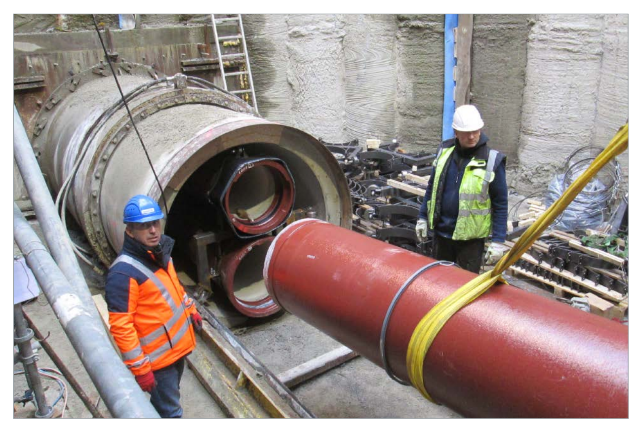
Installation of a DN 600 ductile iron pipe with a BLS® restrained push-in joint