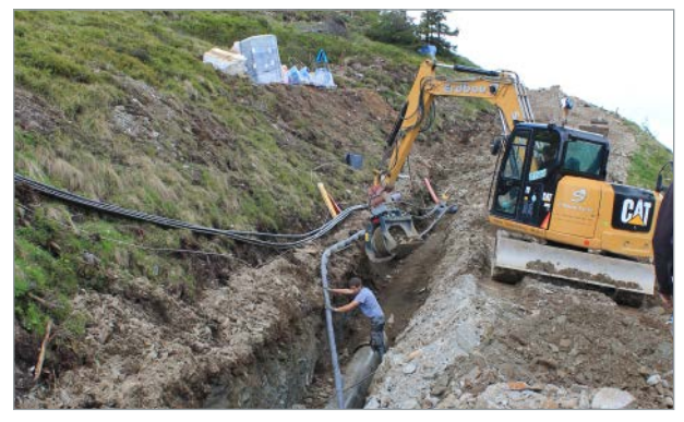
Ductile iron pipes before installation