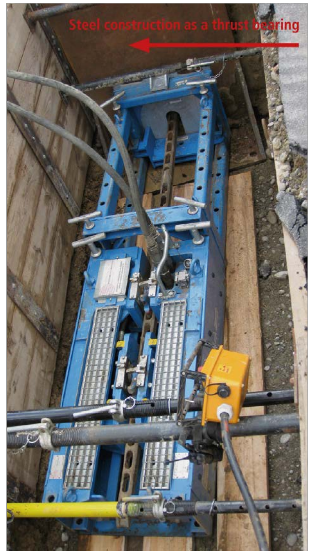
Press-pull technique: traction unit and thrust block

But, outside the exhibition halls, as a visitor to the fair you will also be able to get some first-hand experience. It is traditional for Berliner Wasserbetriebe (BWB) to offer a Showcase on Water . On a tour of pipeline construction sites in Berlin there is an opportunity to see some innovative and environmentally friendly pipeline construction techniques. For example, on 30.03.2017 you can directly experience the use of ductile iron pipes with BLS®/VRS®-T push-in joints and cement mortar coating at the exhibition in Kaskelstraße in the Lichtenberg district. There they will be replacing drinking water pipes using the press-pull technique developed by Berliner Wasserbetriebe.