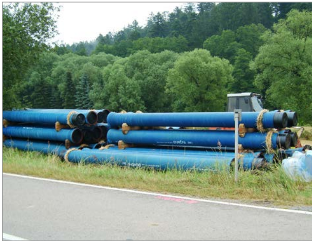
Fig. 1: Ductile iron pipes with the BLS®/VRS®-T push-in joint before installation

The “Roding” water transport pipeline between the pumping station at Neubäu am See and the Reichenbach elevated tank therefore had to be relocated. This pipeline belongs to the Kreiswerke Cham, a utility company with its administrative and operating headquarters for water supply in Neubäu am See, an area of the town of Roding, and it supplies around 40,000 inhabitants of the Old District of Roding and a few neighbouring communities in the Districts of Schwandorf and Regensburg with drinking water. The part of the supply pipeline affected by the relocation operates at a pressure of 30 bars. In total, 348 m of ductile iron pipes in nominal DN 400 were installed. The pipes were supplied with BLS®/VRS®-T restrained push-in joints and a cement mortar coating (Figure 1). The installation of the durable piping system in the pipe trench with the assembly device and locking elements for the BLS®/VRS®-T push-in joint is shown in Figure 2.