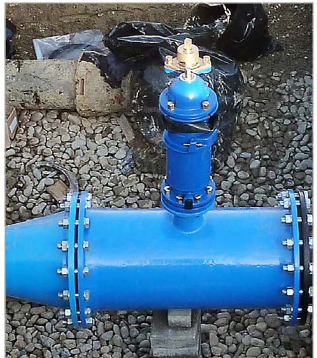
High point with ventilation consisting of a vonRoll VARIO 2.0 underground hydrant and a all flanged tee