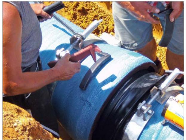
Fig. 2: Locking elements (black and red) shortly before installation in the BLS®/VRS®-T restrained push-in joint

Two important reasons prompted Kreiswerke Cham to decide in favour of this ductile iron pipe system: