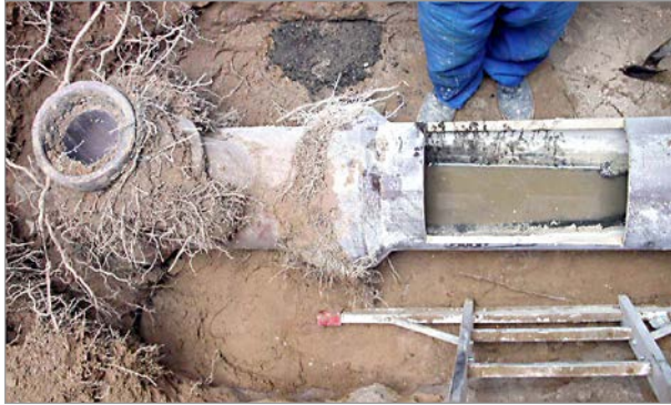
Roots at a depth of 7.00 m, which have grown to this depth because of the good oxygen supply.

“Root penetration in sewers” is known to be an obstacle to flow from the camera inspections regularly carried out inside piping systems. In private drains, root penetration often only becomes noticeable when blockages and backing up occur, along with the resulting consequences. In public sewage systems root penetration is one of the most frequent causes of damage. But in both private drains and public sewer systems these sections of pipelines are considered not to be tight.