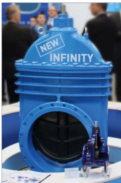
“Infinity” gate valve

◆ TALIS, a world-leading supplier of solutions for the entire water cycle, presented itself at this year’s IFAT as a strong association with all nine of its brands – also including the EADIPS FGR members