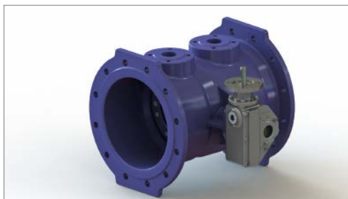
Butterfly valve with venting system