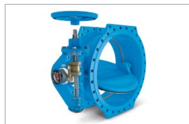
The ROCO wave butterfly valve

The installation of the latest generation of ROCO wave butterfly valves, available in nominal sizes of up to DN 1600, is aimed at those operators who want to reduce the energy requirement of their networks. The flow-optimised “wave design” of the butterfly valve offers minimum pressure loss with high energy