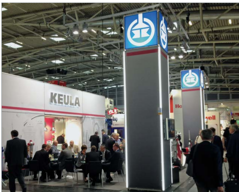
The Keulahütte GmbH stand

◆ A particular focus of discussions on the Keulahütte GmbH Stand at the fair was expansion of export business. IFAT 2016 was the ideal meeting place for this with a multitude of familiar, but also new international clients. Although the timing of the trade fair fell right in the middle of the busiest time for building, Keulahütte was extremely satisfied with the number of visitors and customer contacts.