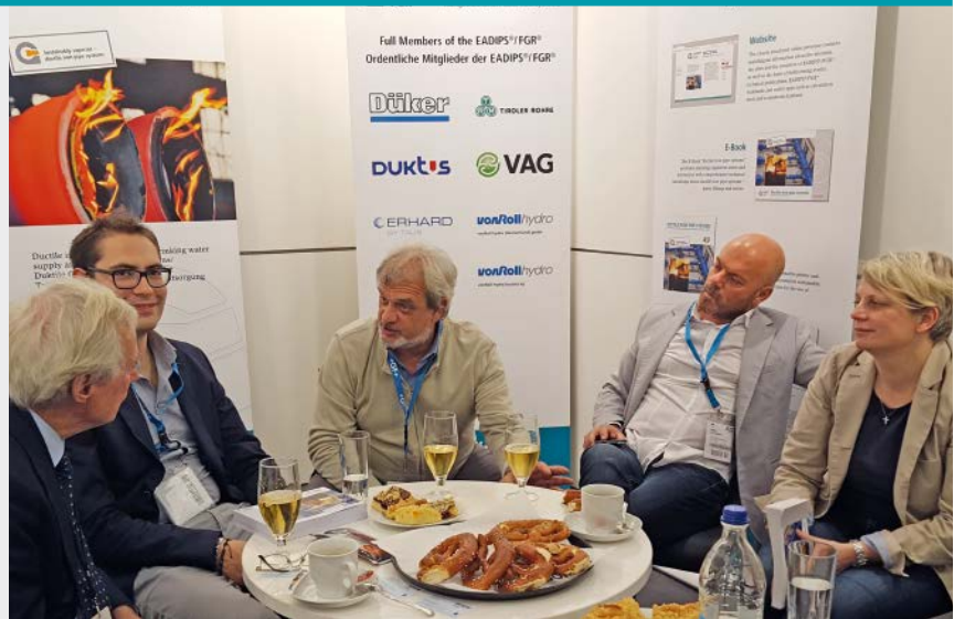
Intensive discussions with EADIPS FGR members from Italy