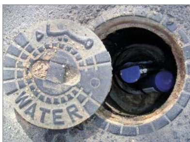
The sensor in an underground hydrant