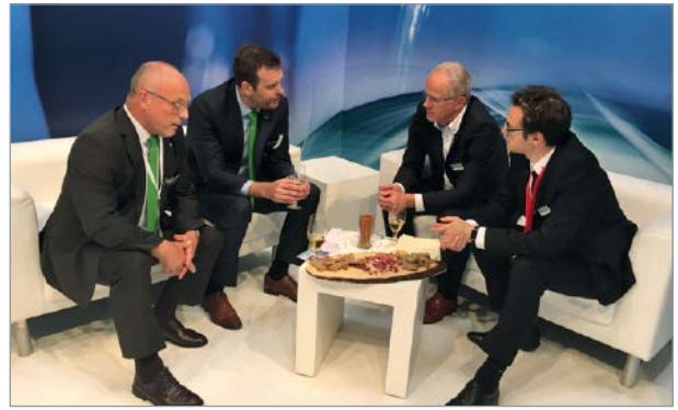
Lively discussion on the TRM stand