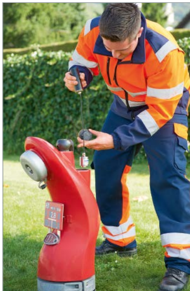
Installing a sensor in a surface hydrant

locking joints and high quality external coatings. This was a great occasion to exchange ideas with planners, construction companies and sales partners about the areas of application for drinking water transport, wastewater transport and turbine pipelines, mining or the trenchless laying technique.