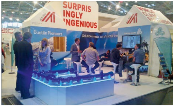
The Tiroler Rohre GmbH stand